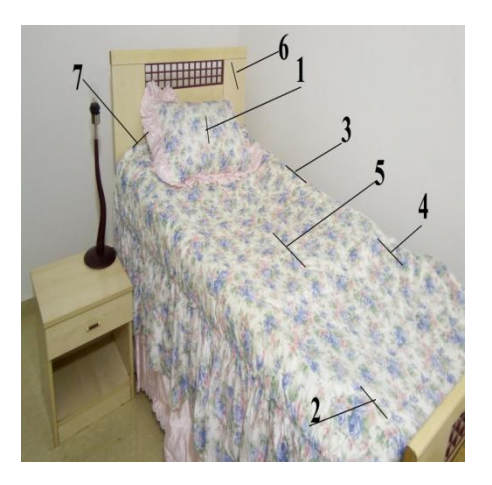
Fig 1: Seven potential entrapment areas in hospital beds determined by the FDA

"The American Food and Drug Administration, or FDA, recently released a statement which discusses in extensive detail the many issues involving patient entrapment on Hospital Beds. The FDA performed extensive background research of their own and sought the information of such reputable organizations as the International Organization of Standards, Stryker International, Hill Rom, the American Red Cross and a number of top American hospitals to find out which areas of modern hospital beds are most dangerous for entrapment, ergonomic data, the number of entrapment occurrences over a number of years and the injuries that resulted. The FDA concluded that there were seven zones which were most dangerous and made size recommendations for those zones to reduce the rate of patient entrapment. Combined knowledge of danger zones, as concluded from the hospitals and bedmanufacturers, as well as the ergonomic data, the FDA determined the seven danger zones as can be seen in the following Figure 12: Seven potential entrapment areas in hospital beds determined by the FDA Figure 1.