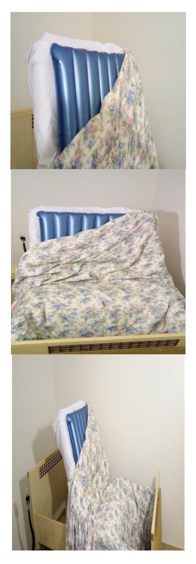
Fig 5: air mattress integrated into the bed system

It is recommended to use Smart mattresses. The first thing that Smart Ranker does is keep track of your sleep smoothly and record data, eliminating the need to wear a high-heeled bracelet to sleep or sleep with your phone. Smart family collects sleep data without having to do anything. To access the data, you can simply open the application and discover your personal sleep information. By helping you understand 1 your sleep, smart mattresses will guide you to a better sleep and thus improve your health. There is no uniform definition of "smart mattress" but it is used informally to describe a ranking that contains sensors to analyse your sleep patterns, provide information about the quality of your sleep, and in some cases, actively improve your sleep. Smart mattresses in the market do so in a variety of ways. Some of them provide sleep tracking functions to measure sleep duration and sleep cycles by observing your body movement, heart rate and breathing. [7]