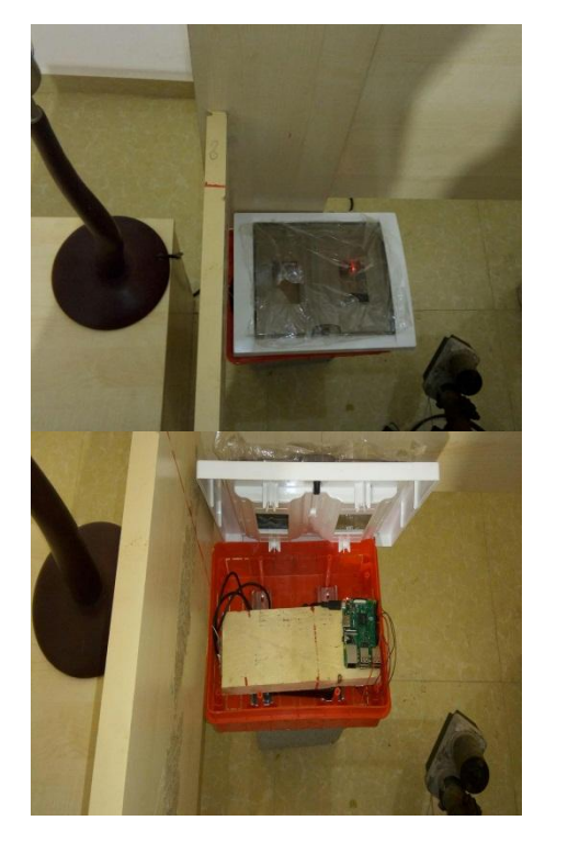
Fig4: Raspberry Pi installation with the bed

Google Cloud Speech-to-Text enables developers and innovators to convert audio to text by implementing powerful neural network models in a simple-to-use API where the voice signal is intercepted by the microphone and converted to an analog signal from a digital signal and the API recognizes 120 languages and variants to support your global user base and take advantage of these features by connecting them with Raspberry Pi. It can enable commands and voice control in many applications and can handle real-time or pre-recorded audio and handle these commands using Google's automated learning technology. Figure 4 below shows the Raspberry Pi installation with the bed which receives the voice commands and turns them into signals and then perform the work required.